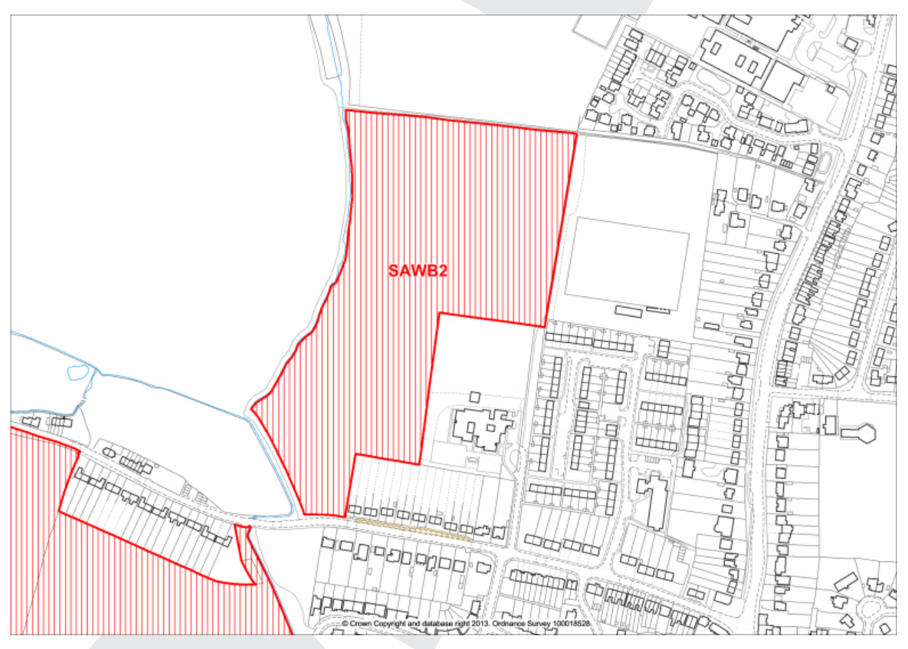
Figure 8.2 Site Location: Land North of West Road